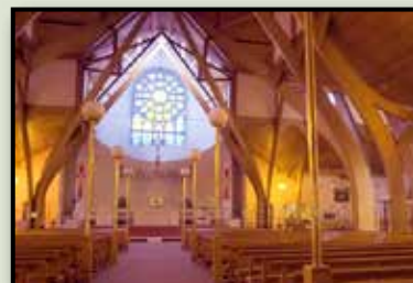
Church of the Assumption, Tullamore

July 19 – Arrival in Dublin with accommodations at Jurys Inn Christchurch (central Dublin).