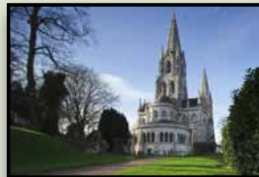
St. Fin Barre's Cathedral, Cork

July 23 – Travel to Church of the Assumption in Tullamore to sing a concert at 8PM.