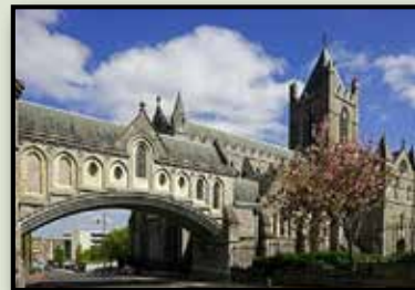
Christ Church Cathedral, Dublin