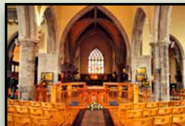
St. Nicholas Collegiate Church, Galway

July 26 – Travel to Galway with accommodations at Jurys Inn Galway and the Menlo Park Hotel