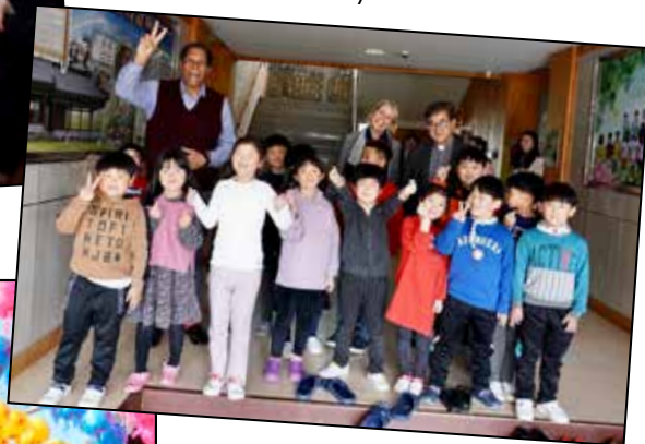
Visit to St. James' sister school, Munui Elementary