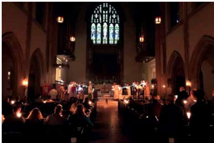
Congregation in Candlelight