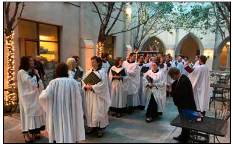
The Choir is ready to go.