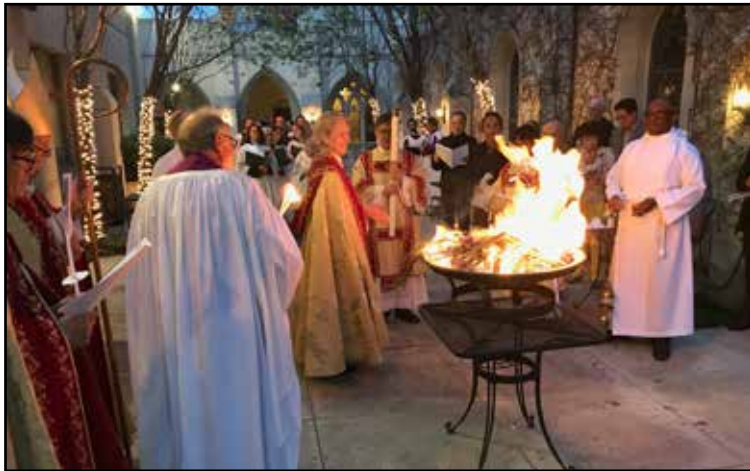
Lighting the New Fire