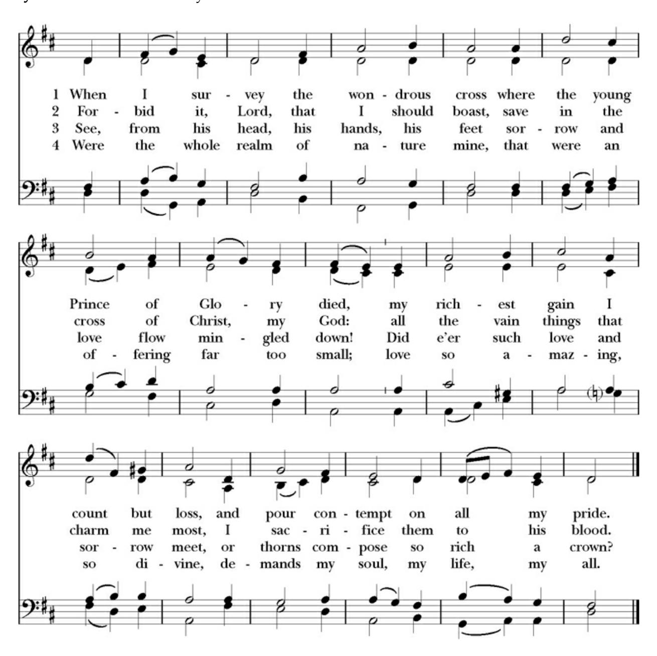
Hymn 474 When I survey the wondrous cross